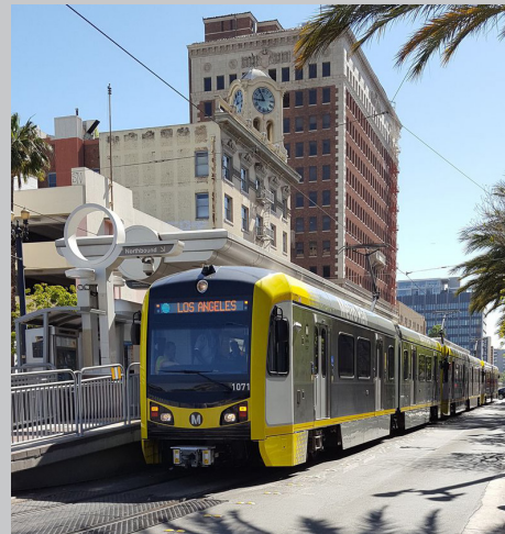
A new P3010 LRV on the Blue Line stops at a station in Downtown L.A.

and transit projects, including expertise in the engineering, procurement, and manufacture of vehicles. In addition to his current oversight role for the P3010 Project, he has supported delivery of system upgrades and new systems