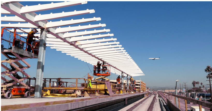
Work is nearly finished on the Aviation/Century Station for the new LAX-Crenshaw LRT Extension Project in Los Angeles County.