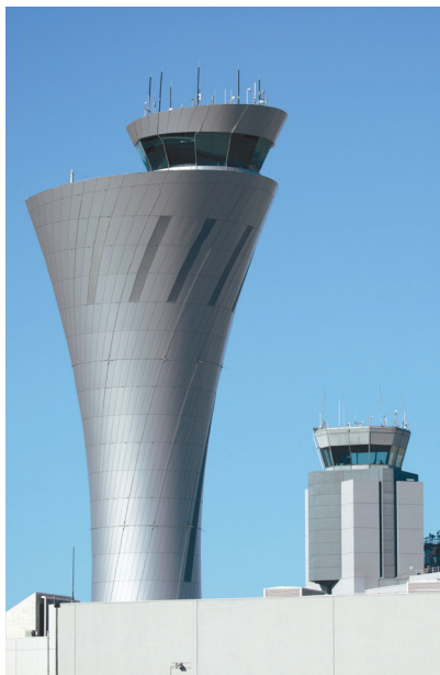
The soaring new ATCT provides a stark contrast to the old tower.

“In a striking departure from the FAA’s normal way of doing business, SFO designed the tower and oversaw the construction work while ensuring that the tower