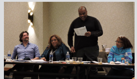
TAG senior managers meet in Emeryville for their February retreat.