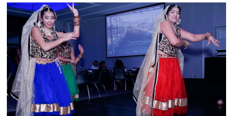
Bhangra dancers lead guests in traditional Indian dance moves.

her achievements by sharing milestones, memorable moments, and poetry that all reflected her strong, compassionate spirit.