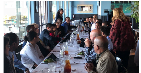
TAG staff welcomed the 2018 summer interns with a dinner in Mission Bay.