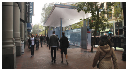
New entrance canopies at Power and Civic Center stations should be completed by August 2018, providing much needed station protection.