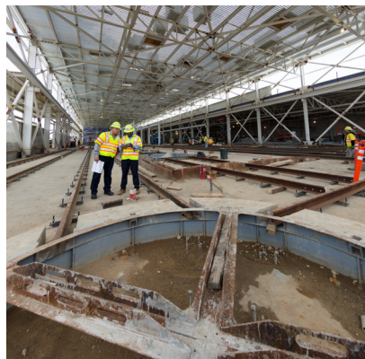
The expansive new Component Repair Shop at HMC