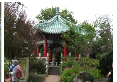
The TAG Scavenger Hunt led its participants to explore numerous locations across Golden Gate Park, including the Japanese Tea Garden, Pioneer Log Cabin, Chinese Pavilion, Portals of the Past, and Bison Paddock.