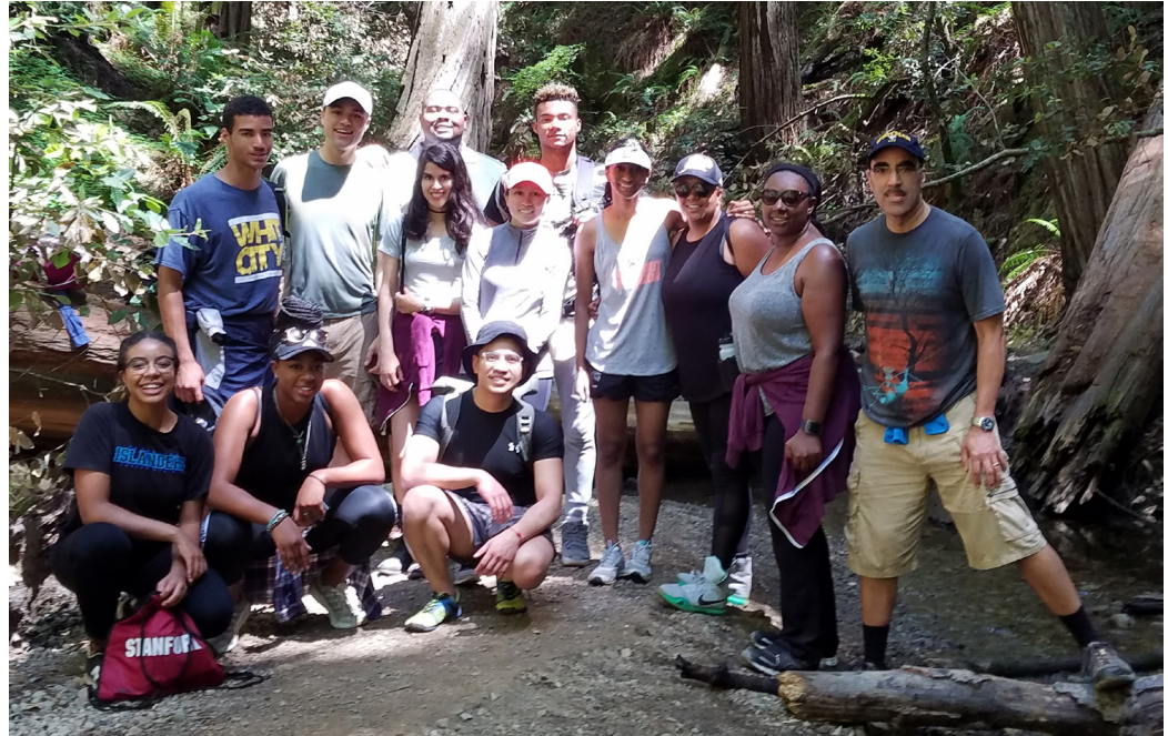
TAG interns, mentors, and colleagues hike at Muir Woods.

In addition to providing hands on job experience, TAG's program affords opportunities to learn more about specific areas of endeavor in our industry. Each intern is assigned to project teams or to TAG offices, depending on their interests and career goals. To this end, TAG sponsors a