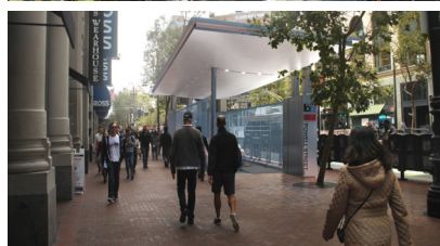
New entrance canopies at Powell and Civic Center stations should be completed later in 2018, providing much needed station protection.