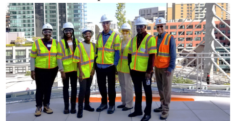
TAG Summer 2018 interns on a tour of the new SF Transbay Transit Center.

The interns are back at school with a wealth of knowledge and long-lasting relationships from their TAG experience.