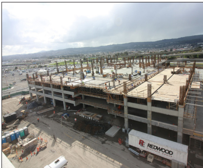
SFO's new parking garage is nearing the topping-out milestone

Exciting high-tech features include the Automated Parking Guidance System (APGS), which guides